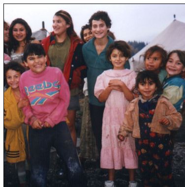
Roma (Gypsy) children in Slovakia