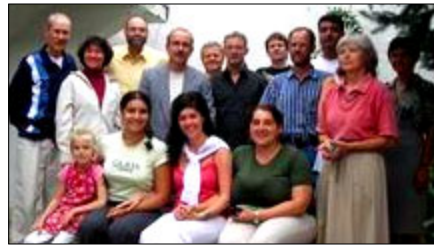
4th International Gypsy Summit Participants

"I confess from the outset that my trip to Slovakia was taken for selfish reasons. Of course I went to encourage and pray with the missionaries working with the Gypsies, but I went more to be encouraged and fed by those who are making such incredible sacrifices to bring the Gospel to the Roma people. Although some of the